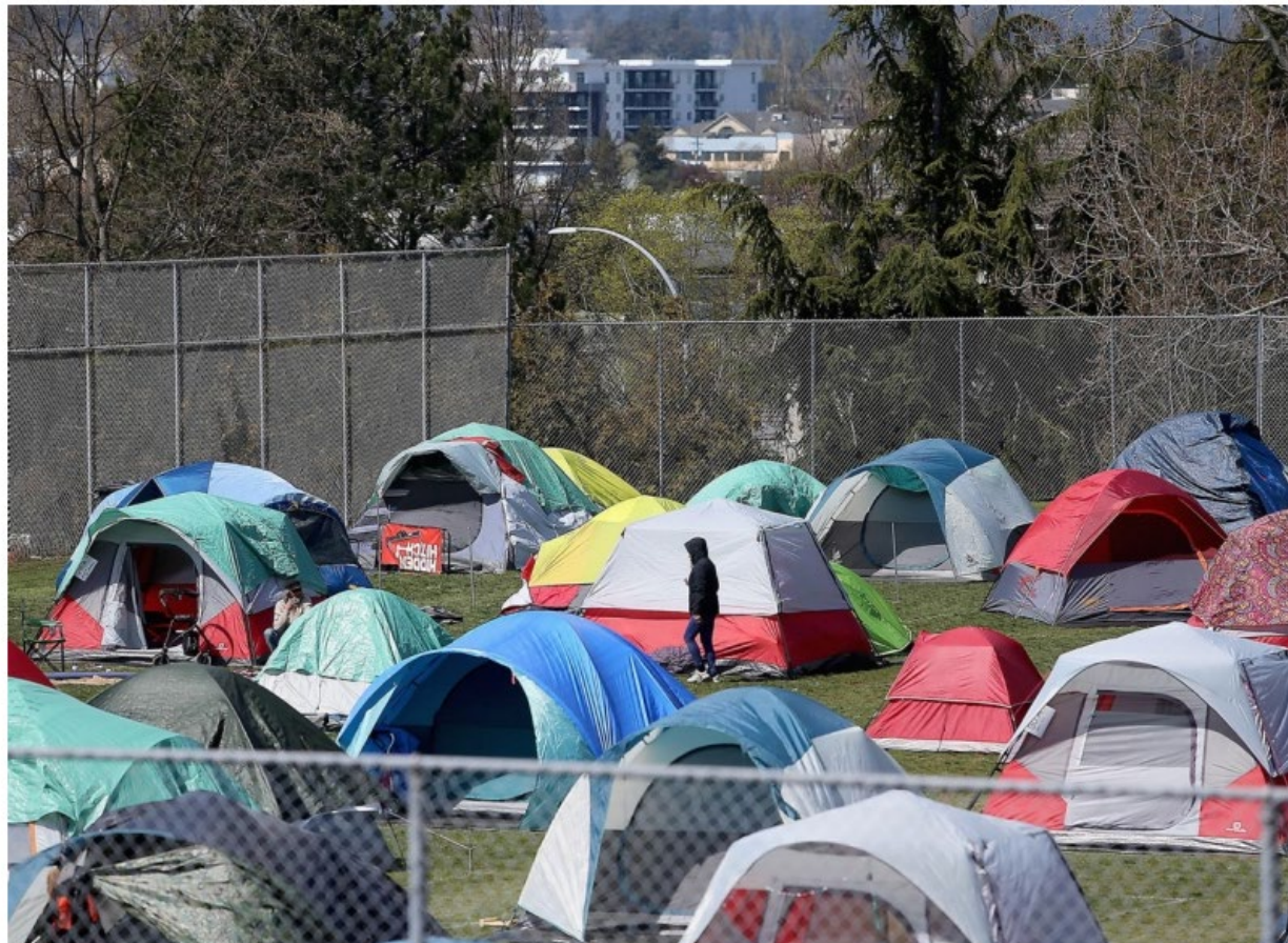
Tents at Topaz Park in Victoria, where many people who don't have homes are staying during the pandemic.