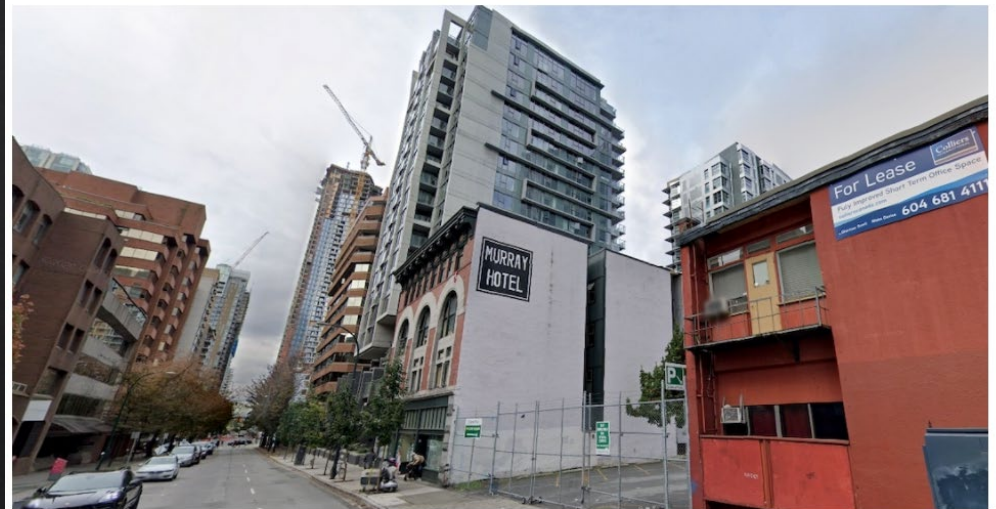
The empty lot at 1115 Hornby Street, next to the Murray Hotel, is the site of new washroom trailers.